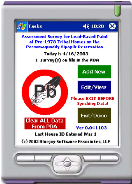
Assessment Survey for Lead-Based Paint of Pre-1978 Tribal Homes on the Passamaquoddy Sipayik Reservation Using the Pre-78 Pb Assessor